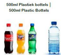
500ml Plastiek bottels | 500ml Plastic Bottles 38x500ml Bottles =1Kg 38x500ml Bottles =1Kg

Alle blikkies en bottels moet plat gemaak word voordat dit in gehandig word | All tins and bottles must be flattened before handing them in