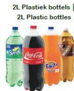
2L Plastiek bottels | 2L Plastic bottles 20x2L Bottles =1Kg 20x2L Bottles =1Kg