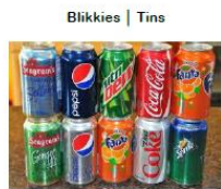
Blikkies | Tins 60 Blikkies | Tins = 1Kg 30 Blikkies | Tins = 0,5Kg